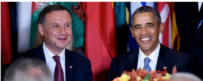
Andrzej Duda, President of Poland, with President Obama at a dinner during the UN General Assembly in New York, last September.

Poland and the United States are more than strategic partners; we are close friends and allies with a shared history and values. After the 9/11 attacks, Poland responded to America's call for solidarity, and its soldiers served in Iraq. In Afghanistan, Poland provided one of the largest military contingents to the NATO-led mission, and our military advisers continue to help train Afghan troops.