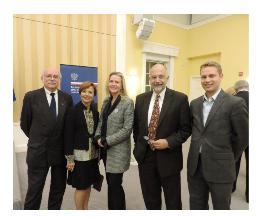
Celebrating Polish Independence Day at the Republic of Poland Embassy in Washington, D.C.