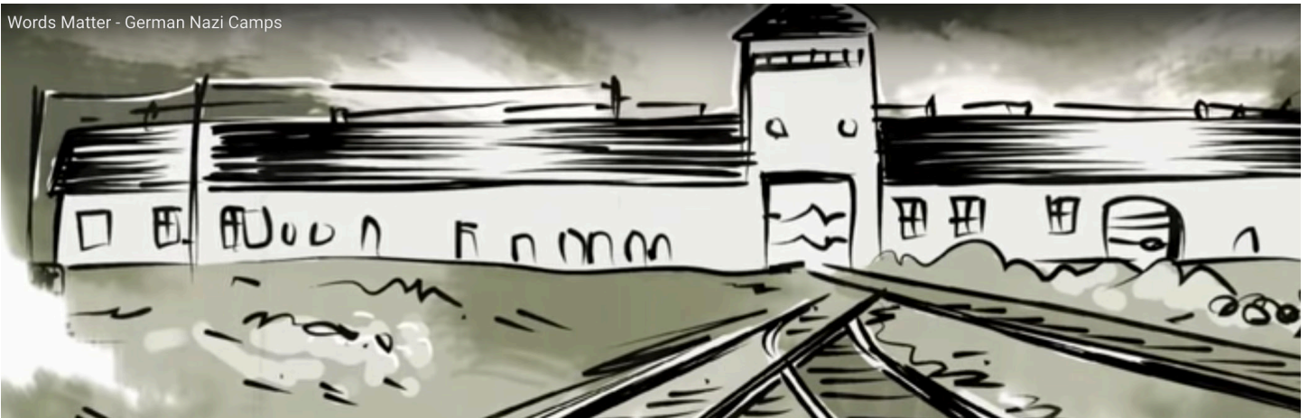
Words Matter - German Nazi Camps

To view the video, please visit youtu.be/uDpTcXQ8Na0 by copy/pasting into your browser.