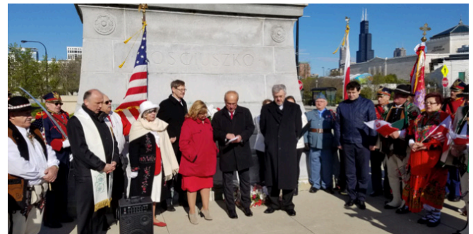
Wreath laying celebrating May 3rd Constitution Day