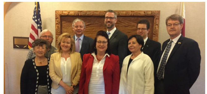
Newly elected PAC - IL Division Executive Committee

Happy Fourth of July from your PAC Executive Committee!