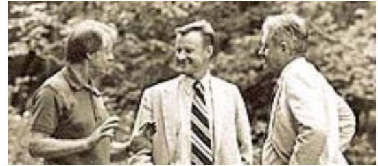
In 1977 at Camp David, President Jimmy Carter with Brzezinski and Secretary of State Cyrus Vance.