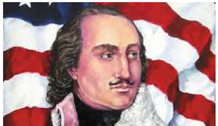
General Casimir Pulaski