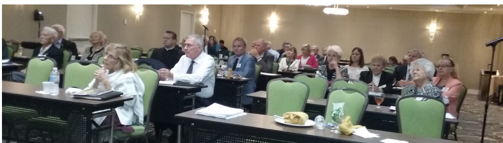
National Directors at work.