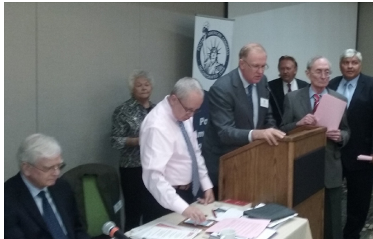
Resolutions Committee performs their duties in an excellent manner!