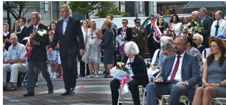
“Gdy Polacy będą umieć siebie samych cenić w domu, będą ich cenić i za granicą.” — Stanisław Staszic