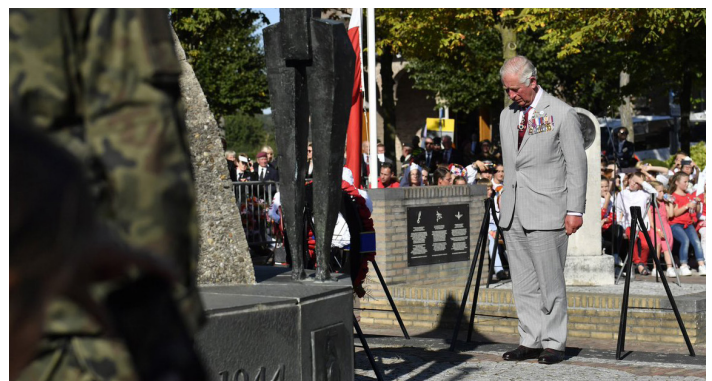
England's Prince Charles bows head after laying a wreath during the Polish Airborne Commemorative Service in Driel, near Arnhem in The Netherlands.