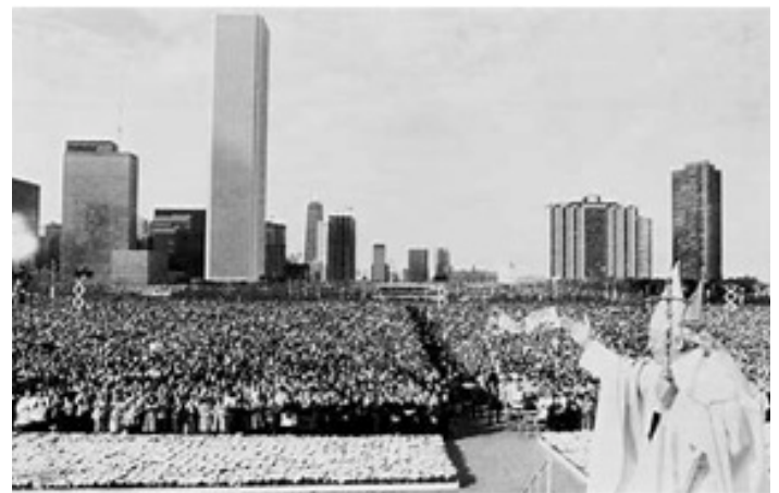
Pope John Paul II saying Mass to 1.5 million people in Chicago's Grant Park in 1979.