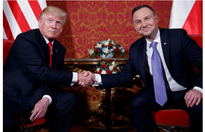
President Donald Trump and Polish President Andrzej Duda.

What previously prevented Poland's VWP entry? A provision in the Immigration and Nationality Act that requires a visa refusal rate of 3 percent or less to qualify for the program — and arguably a lack of previous presidential leadership on this issue. According to the State Department, Poland's visa refusal rate has consistently dropped during the Trump administration to a point at which it now appears, based on President Trump's statements and U.S. State Department action, that Poland has met the legal requirements for program admittance.