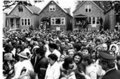
A total of 200,000 parishioners gather for Mass to be celebrated at Five Holy Martyrs Church on October 5, 1979.